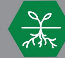
Amenity Horticulture, Landscaping, Conservation and Land Management