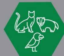
Animal Care & Management