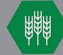
Agriculture and Production Horticulture