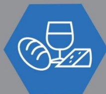
Food, Beverage Manufacturing