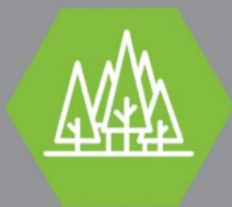
Forestry Management and Harvesting