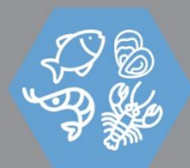
Aquaculture and Wild Catch