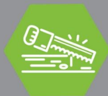
Timber and Wood Processing