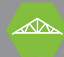
Timber Building Solutions