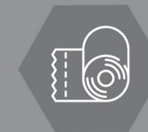
Pulp and Paper Manufacturing